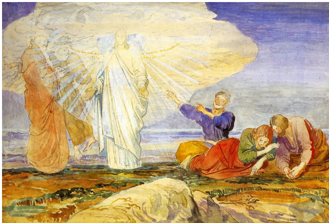
Transfiguration by Alexandr Ivanov, 1824